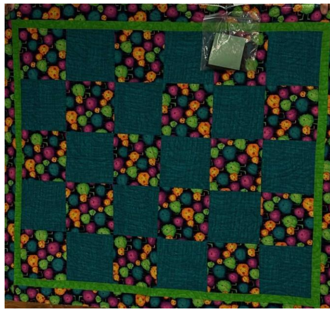
Antelope Valley Quilt Association Board Meeting Minutes -- March 18, 2025