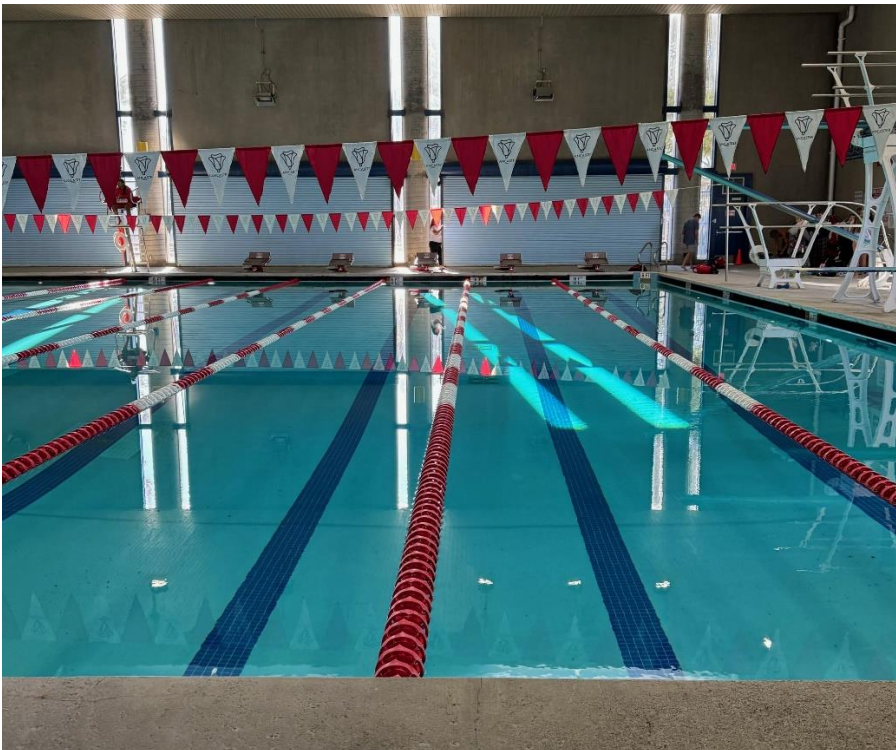
Eastside Pool Lancaster